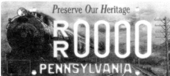
Plate #906 Preserve Our Heritage

Plate Colors - Blue, yellow, purple and white