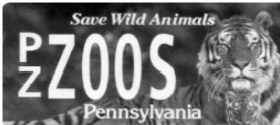
Plate #908 Pennsylvania Zoological Council Fund

Plate Colors - Brown, orange, red and white