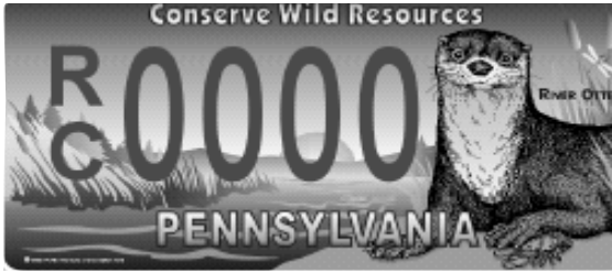
Plate #905 Pennsylvania Wild Resource Conservation

(Please Check Type of Plate Requested on Front Side of Form)